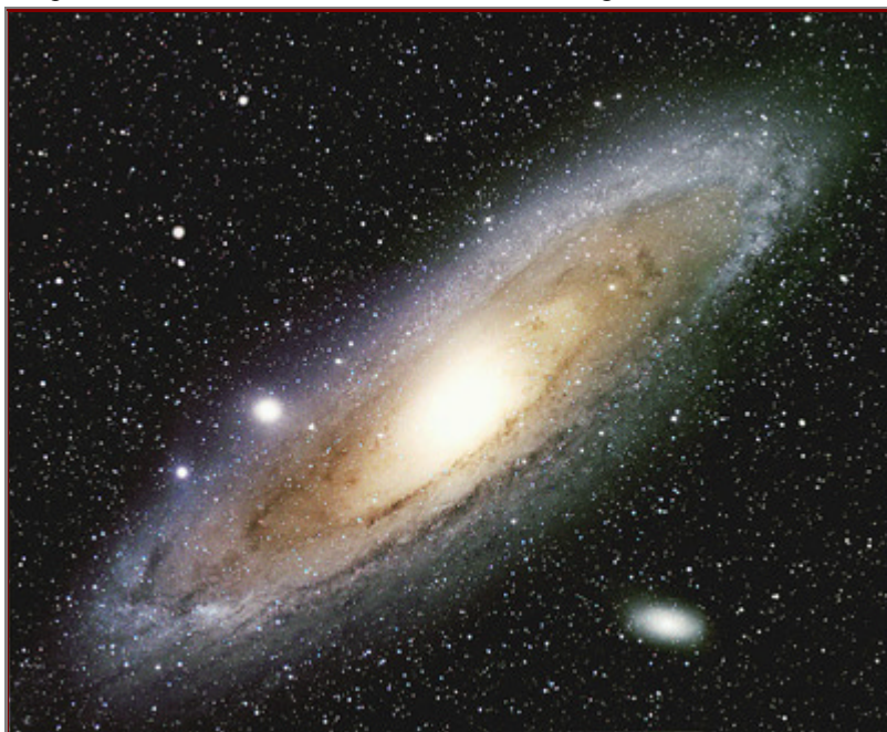
M31. ST-8E two image mosaic of Andromeda galaxy taken through a 4" refractor using a CFW8 filter wheel.

656x495 pixel, guiding CCD. Communication to the PC is through the USB port. The Full Frame download time is approximately 3.7 seconds, nearly 14 times faster than the previous parallel port version of this camera. The image update rate in focus mode is approximately 2 frames per second. SBIG actively encourages wide field imaging with the Model ST-8XME. We offer Camera Lens Adapters (CLA-7) to attach standard camera lenses to the imaging camera. In wide field imaging the ST-8XME, CLA-7 and camera lens are typically mounted piggyback on the primary telescope, which acts as a guiding platform. The ST-8XME is set for the high resolution (9 x 9 micron) pixel mode to match the short focal lengths of the camera lens. SBIG has received wide field customer images with 4 to 5 degrees field of view showing large extended objects with much detail and structure. Wide field imaging (i.e., f/2 to f/4) is easy to do, as locating objects becomes a relatively simple matter and guiding is much less critical at the short focal lengths of 100 to 400 mm. We urge our customers to try this technique with both Models ST-7XME and ST-8XME.