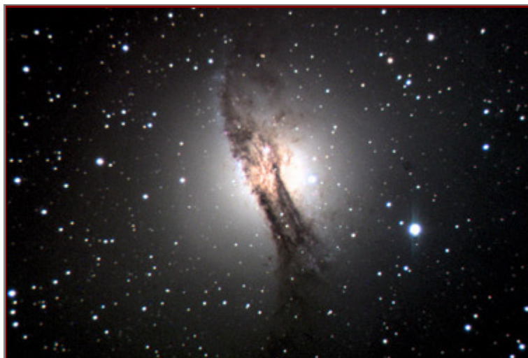
NGC 5128. This ST-8E image of Centarus A was taken through a C14 telescope at f/11.

In its price range, the Model ST-8XME is unmatched in resolution, performance, low noise and field of view in the amateur astronomy market and, therefore, is widely used in astronomy for high resolution imaging and wide field searches for near earth asteroids, comets, supernova, etc. The dual CCD structure allowed SBIG to design an Adaptive Optics System to work in conjunction with the ST-8XME and ST-7XME. This unique system is described under the Accessory Products section of this catalog.