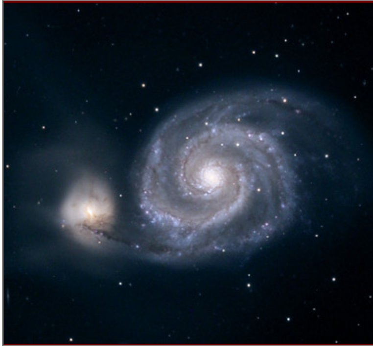
M51. Model ST-8E image of the Whirlpool Galaxy taken through a 12.5" f/6.7 telescope.