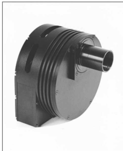
ST-8XME CCD IMAGING CAMERA

The Model ST-8XME is identical to the Model ST-7XME except that it is furnished with a 4x larger imaging CCD. The imaging CCD has a Full Frame Resolution of 1530 x 1020 pixels at 9 microns square and the tracking CCD has 657 x 495 pixels at 7.4 microns square. The imaging CCD utilizes the latest microlens technology and AR coated cover glass found in the ST-7XME and ST-10XME cameras. This technology boosts the peak Quantum Efficiency of the CCD to nearly 85% and improves sensitivity across the visible spectrum. Since the ST-7XME and ST-8XME imaging CCD detectors are pin to pin compatible, SBIG designed the CCD head to accept either detector. As a result the Model ST-7XME is easily upgraded to the Model ST-8XME. The large CCD active area of 13.8 x 9.2 mm allows the user to image large fields of view with the ST-8XME. The various binning modes of 9, 18, and 27 micron pixels allows the user to match the focal length of a wide range of telescopes and lenses to this imaging camera. The imaging camera includes an electro-mechanical shutter, 16-bit analog to digital (A/D) converter, regulated temperature control with all of the electronics integrated into the CCD head and a built-in, cooled, TC-237H,